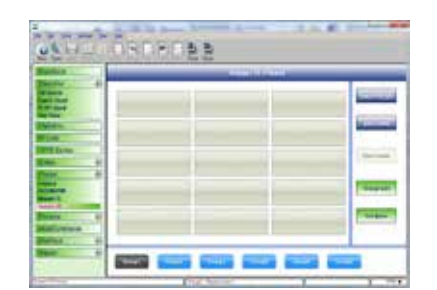
WinDataBack enables technicians to allocate products to specific preset keys on the touchscreens of all in-store scales or groups of scales.

Please contact your METTLER TOLEDO system consultant for additional information about scale management software products.