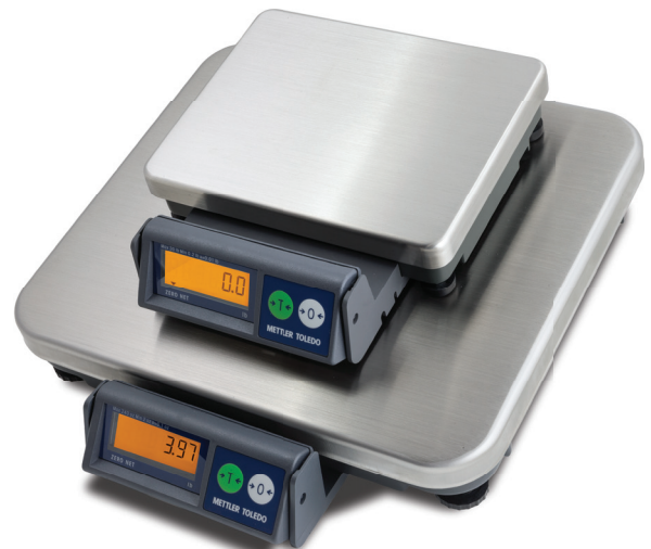
Ariva-S-Mini shown on top of Ariva-S

The Ariva-S-Mini standalone checkout scale is the METTLER TOLEDO checkout solution for retailers with the most stringent demands. The Ariva series for weighing at the register comprises weighing modules to be installed in bioptic scanners (Ariva-B), scales for integration of horizontal scanners (Ariva-H) and standalone scales without scanners (Ariva-S and Ariva-S-Mini).