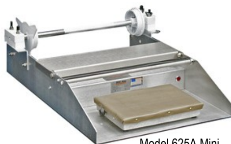
Model 625A Mini