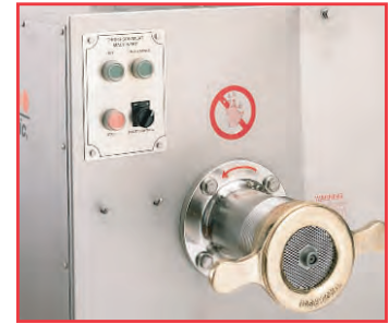
Convenient on/off and mix/grind push button controls