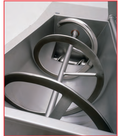
Conical hopper, mixing ribbon feedscrew and grinding head are all made of smooth finished stainless steel.