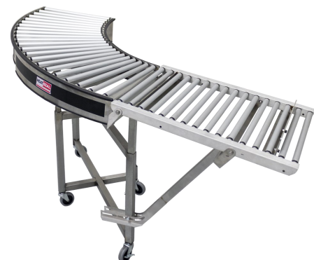
Model GTC90 Right Hand/Operator Side