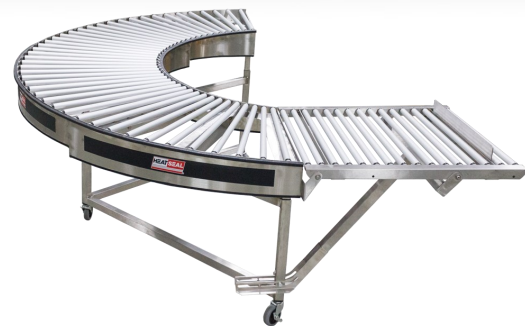
Model GTC180 Right Hand/Operator Side