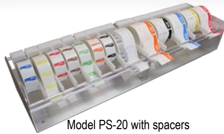
Model PS-20 with spacers