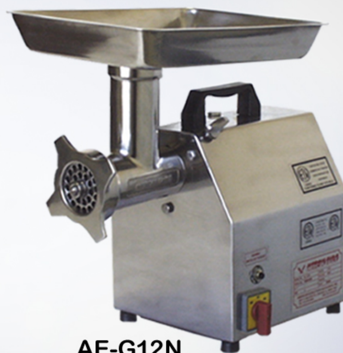
AE-G12N 1 HP