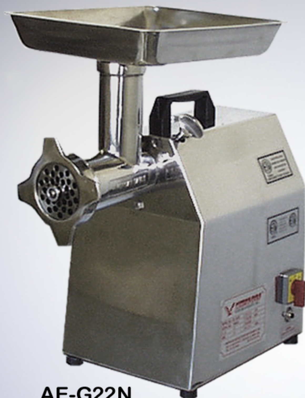
AE-G22N 1-1/2 HP