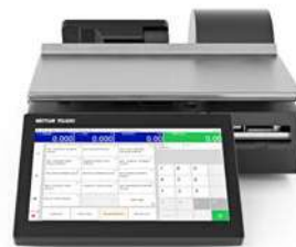
FreshBase C3 with 12.1-inch display