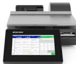
FreshBase Lite with 10.1-inch display